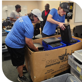
TexasBank IT department volunteers give computers and tech a second life supporting Compudopt's mission to bring technology and resources to families and communities in need.